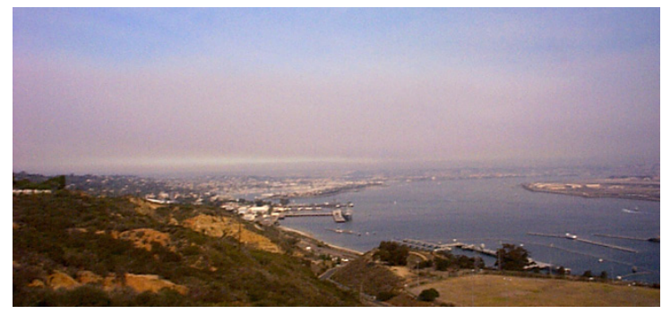
A view of smoke over San Diego on 3 January 2001, as the Viejas Fire raged to the east.

Fires produce a stronger signal in the mid-wave IR bands (around 4 microns) than they do in the long wave IR bands (such as 11 microns). That differential response forms the basis for most Fire Detection and Characterization ( FDC ) algorithms, including the algorithm used for GOES-R. FDC was taken into account when creating the specifications of the 3.9 micron band on ABI, allowing GOES-R