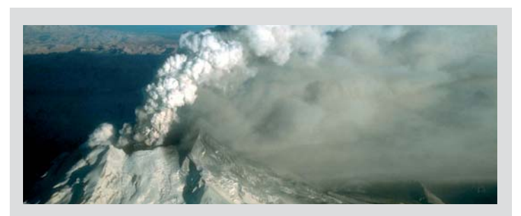
Image of the December 1989 Mt. Redoubt eruption (Upper) demonstrates that a large quantity of volcanic ash can be rapidly injected to aircraft cruising level. Heavy ash fall from this eruption also caused significant engine damage to a KLM passenger jet (Lower).

The GOES-R Volcanic Ash and SO_2 Detection products are generated from infrared radiances, which are day/night independent. ABI channels centered at 7.3, 8.5, 11, 12, and 13.3 \mu m are used in the algorithms. The 8.5, 11, and 12 \mu m channels provide information on cloud particle size and composition, the 13.3 \mu m channel detects ash cloud height, and the 7.3 \mu m channel detects SO_2 clouds. These algorithms are unique because they account for background