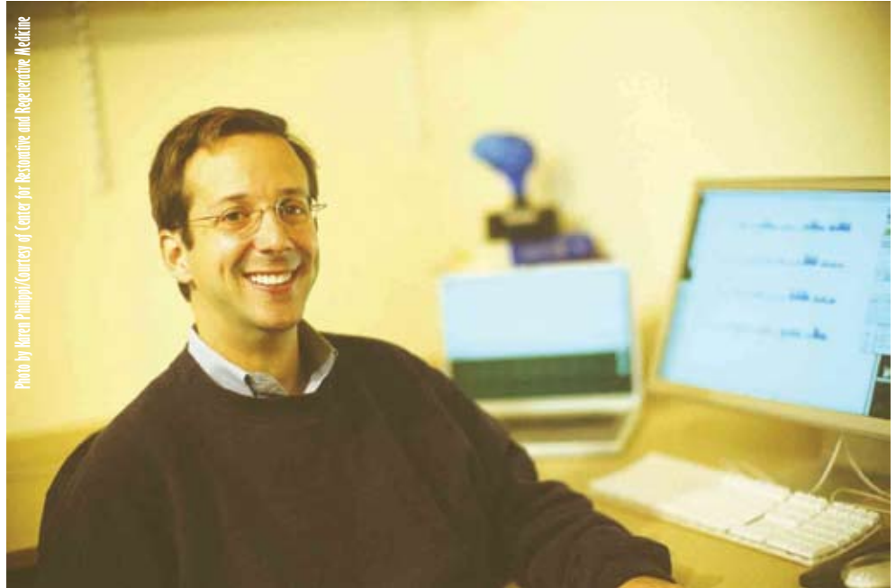
Leigh Hochberg, MD, PhD, is lead investigator on two clinical trials of a brain-computer interface called BrainGate.

This approach avoids some of the risks of brain implants, and may eventually prove viable for many patients with disabilities. One drawback with EEG, however, is that the output is less precise than with implants, and users need far more training than with BrainGate to effectively control a cursor.