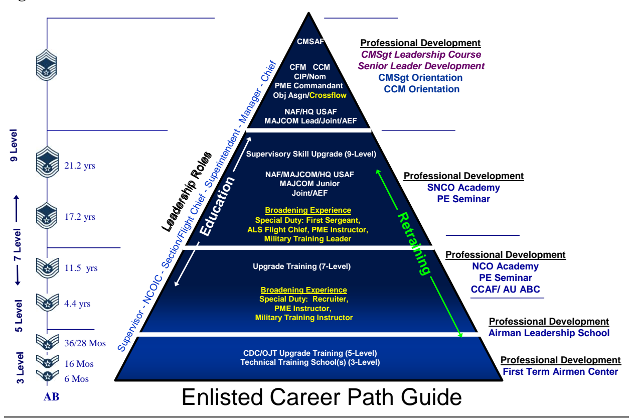
Figure A5.2. Enlisted Career Path Guide