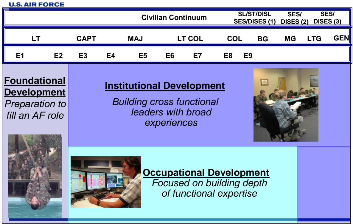
Integrity - Service - Excellence