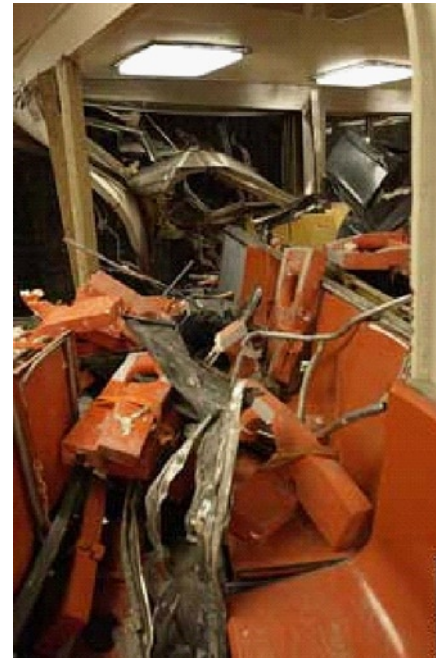
Figure 3-1. Interior of Staten Island Ferry post-accident

The ferry, carrying 1,500 passengers, was on a routine run across New York Harbor from lower Manhattan with its captain alone in the wheelhouse. The captain blacked out, and the ship ran full speed into a concrete pier. At his trial, he admitted to suffering from extreme fatigue and using painkillers, stating, "I will regret for the rest of my life that I did not call in sick." He was sentenced to 18 months in prison, and his supervisor was sentenced to a year in prison for failing to enforce the regulation that a ferry must be operated by two pilots whenever it is docking. Enforcement of that two-person