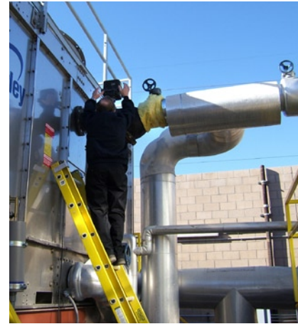
Figure 1-3. A reenactment showing a worker reaching to operate the valve

handwheel on the gravel. The worker's awkward position on the ladder, coupled with an inadequately installed valve handwheel, resulted in the worker falling from the ladder.