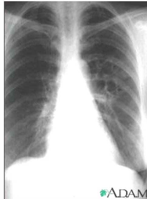
Figure 2-2. Chest x-ray showing effects of Valley Fever on the lungs

The chest x-ray in Figure 2-2 shows some effects of Valley Fever in the lungs. In the middle of the left lung (seen on the right side of the picture) there are multiple, thin-walled cavities