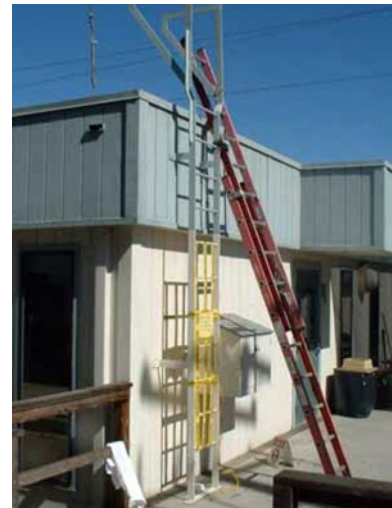
Figure 1-1. The accident scene showing the fixed ladder and an extension ladder added post-accident for temporary roof access

The proper climbing technique of moving only one limb at a time while three others remain in contact with the ladder is required by ANSI A14.3-2002, American National Standard for Ladders - Fixed - Safety Requirements , which is addressed in LLNL's ladder safety training. However, the Board believes that the training did not instill an adequate understanding of the safety importance of this climbing technique and did not ensure that the electrician was proficient in using it.