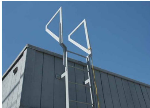
Figure 1-2. Walk-through section of the ladder with angle iron at the grips

The first two areas were likely contributors to the accident; the last two could have resulted in a misstep similar to what the electrician experienced.