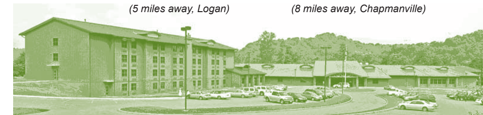
CHIEF LOGAN LODGE

Rodeway Inn 44 rooms 304-855-7182 (8 miles away, Chapmanville)