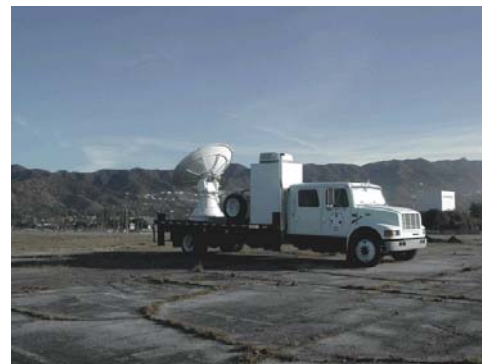
The SMART-R being used near the Day Fire burn area in California to study debris flows.

NSSL has a research partnership with the Cooperative Institute for Mesoscale Meteorological Studies (CIMMS), a cooperative institute between NOAA and the University of Oklahoma. Additionally, NSSL conducts collaborative research with the NWS, other NOAA Research laboratories, North Carolina Sea Grant, the U.S. Navy, Air Force, Army, Department of Transportation, Federal Aviation Administration, the University of Oklahoma, Texas A&M University, Texas Tech University, the Chickasaw Nation, and several corporations.