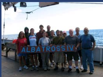
2007 Autumn Bottom Trawl