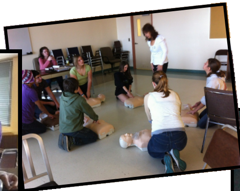
Northern Area Teen Council (Left) were trained in CPR by the Red Cross., Southern Teen Council (right)- had a visit from UCLA Financial Planning Team,