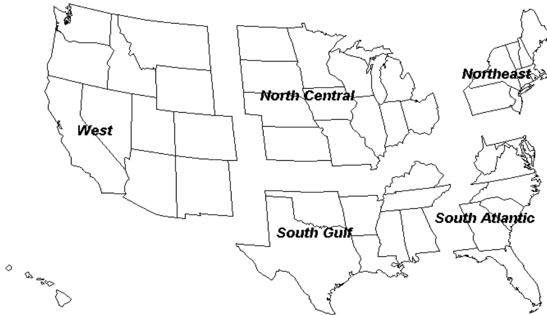
Estimated Vehicle-Miles of Travel by Region - December 2002 - (in Billions)

Travel on all roads and streets changed by +1.4 percent for December 2002 as compared to December 2001.