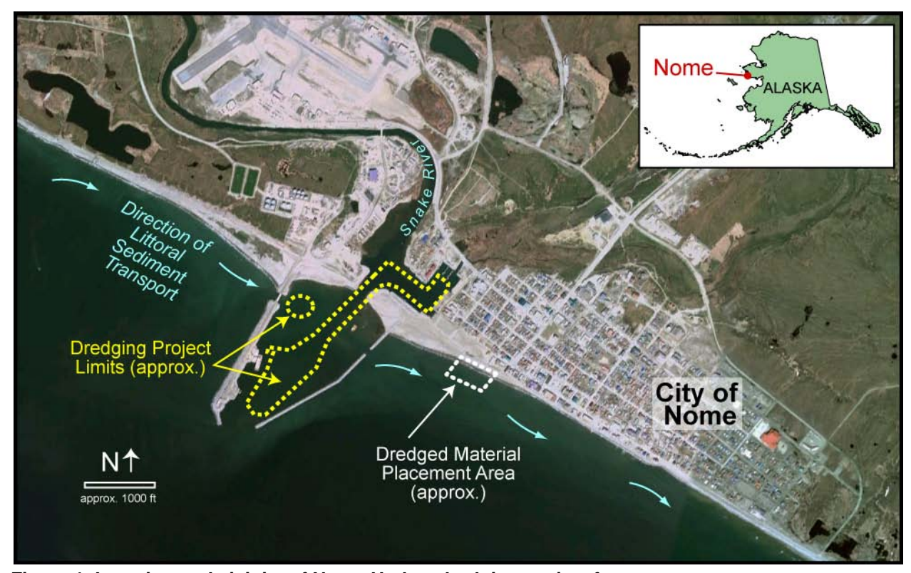
Figure 1. Location and vicinity of Nome Harbor dredging project features.

The proposed action is to conduct annual maintenance dredging within the Federal project limits at Nome Harbor to include the entrance channel, the inner north harbor, and the sediment traps as needed (figure 1). Coastal transport mechanisms and storms deposit large quantities of marine sediment within the channel, and the Federal project must be dredged annually to maintain the authorized project depths and preserve safe navigational access. Without the proposed action, shoaling will rapidly restrict access to Nome Harbor by ships and barges.