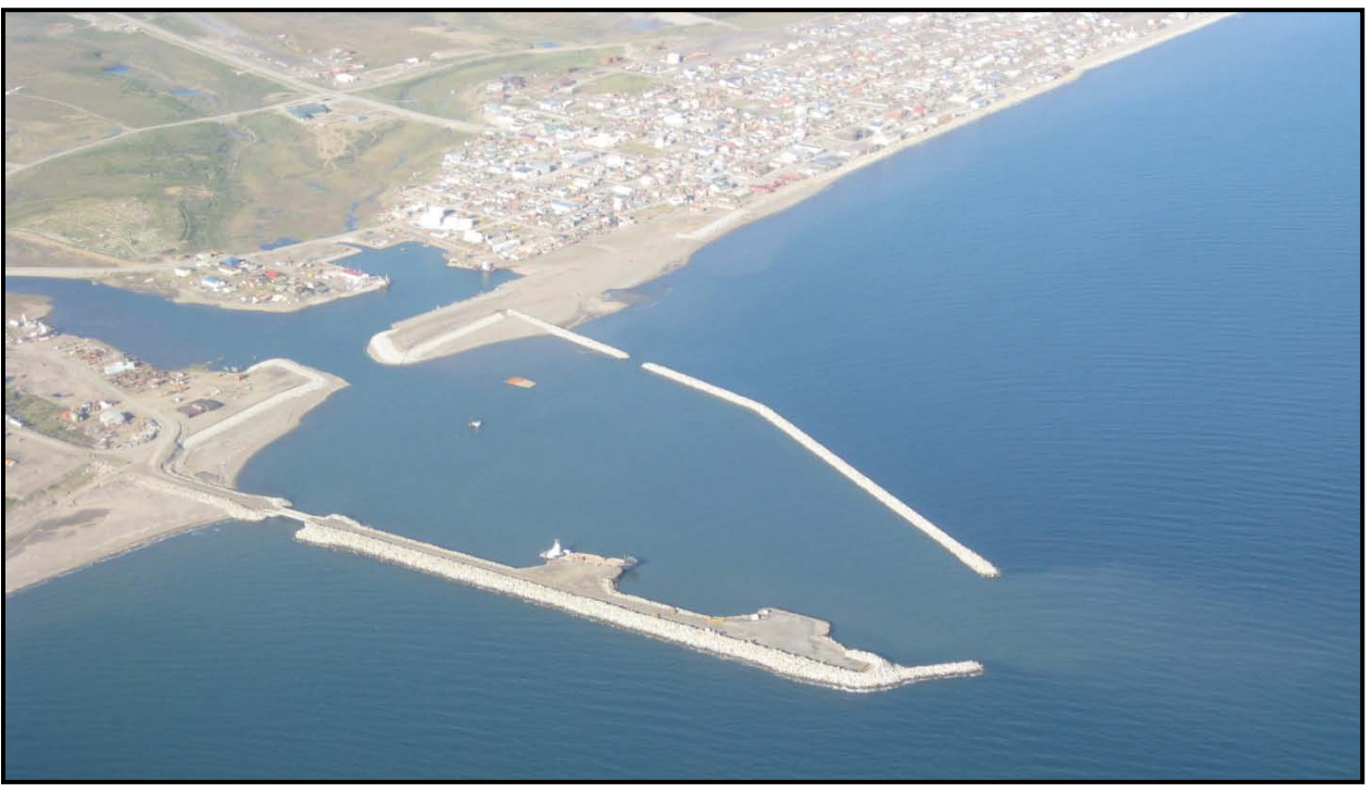
Figure 1. Aerial oblique view of current Nome harbor configuration; view is towards the east-northeast.

The current configuration of Nome Harbor, shown in Figure 1, has existed since 2006. The entrance channel requires annual dredging to remove sediments deposited by littoral transport.