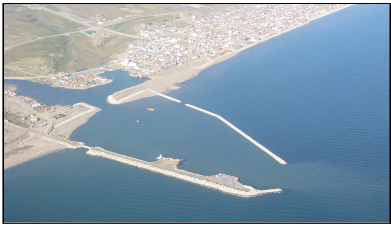
Figure 3. Aerial oblique view of current harbor configuration; view is towards the east-northeast.