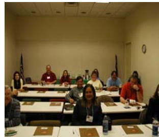
Free Web Clinic in Casper August 2004

grant-writing workshops this year. The first provided a chance for faith-based and community groups to meet with organizations that provide grants and the second was on how to become more competitive for federal grants. We sent out toolkits to mayors, the Governor and our Tribal leaders on the Faith-Based and Community Initiative. In addition,