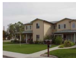
Multifamily project in Sheridan using HOME funds.

Community Development Authority (WCDA) and USDA Rural Development to discuss multifamily preservation and met with all of our partners to resolve a variety of rental housing issues in the state.