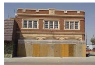
Casper Fire Station

ability of affordable housing. The Casper Field Office continued to seek ways to make HUD’s programs more effective for rural America.