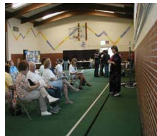
Life Steps Campus homebuyer fair

at an all-time high, homeownership for Native Americans and minorities remains low. Our office continued to take steps to narrow this gap. We provided assistance to the Indian Housing Coordination Committee and participated in several cultural events to promote homeownership.