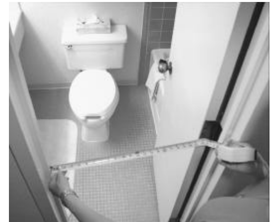
Photo of How to Measure Clear Passage Width at a Door

exactly where to measure. The photo below shows that you measure horizontally from the face of the door in its 90 degree open position to the surface of the door stop on the frame opposite the hinge. The 21" clear passage width shown below is too narrow to allow wheelchair passage. It should be at least 32". If a pair of doors are at an opening, measure the clear passage width of only one (the widest) door - this clear passage width is not allowed to be determined by opening both doors.