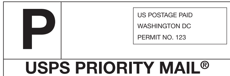
Exhibit 3.1 Priority Mail Service Indicator