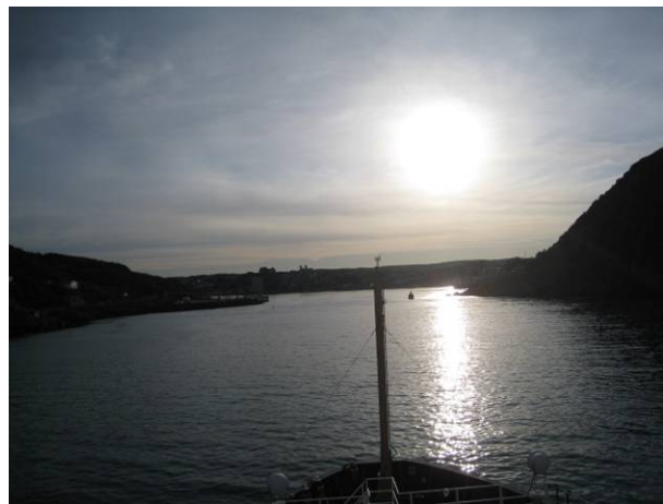
The Port of St. John's, Newfoundland, Canada