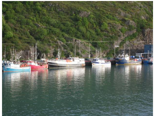
St. John's lovely harbor

While on shore, fresh produce was picked up so we will be able to enjoy fresh food for a few days more. The food has been really good with a wide variety being served. Each day for lunch and dinner there are usually two choices for the main dish, seafood and a meat with vegetables each day. So far we have had duck, rabbit, and filet of sole, salmon, scallops, fish stew, vegetable lasagna, ribs and many more different items. We even had a cookout with grilled sausages and hamburgers.