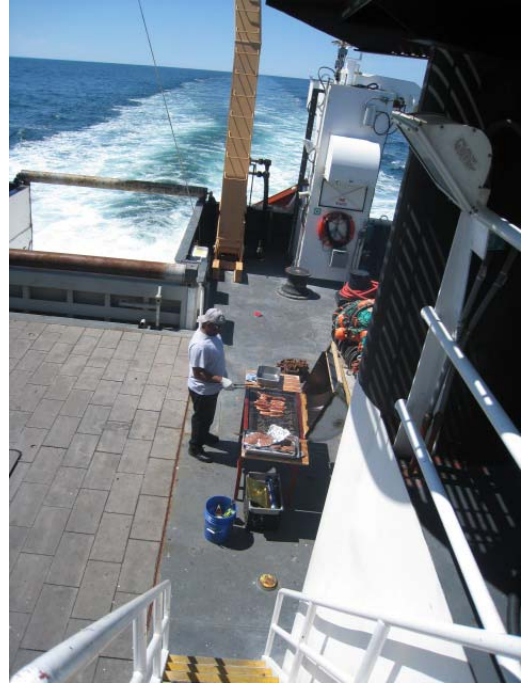
Grilling on the back of the ship. One of the crew made the grill from an old barrel and installed the handle and the base.