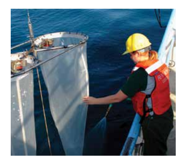
The USGS research vessel Kiyi collects new scientific information on ecosystem functions and fish behavior, all of which supports fishery management and sea lamprey control.

The commission, during the next decade, will encourage its partners to collaborate on the establishment, review, and revision of research priorities essential for fishery management decision-making. Information about interactions among species and between species and their environment is needed if managers are to anticipate and respond to changes. Therefore, important areas of commission research will focus on large-scale disturbances such as climate change and how they influence fish communities; the causes for rapid ecological change in