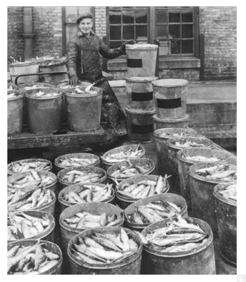
Lake cisco haul at a commercial platform illustrates the large catches in the Great Lakes in the early 1900s.

in 1829. Rainbow smelt were introduced into Crystal Lake, Michigan, in 1912 and quickly spread into Lake Michigan and the other Great Lakes. By the middle of the 20th century, rainbow smelt and alewife dominated fish communities across the basin and largely replaced the native ciscoes, which had been key forage species. Lake trout, the native top predator, was extirpated in three of the lakes by the combined effects of over-fishing and sea lamprey predation. By 1960, Lake Erie's signature fish, the blue pike, was nearly extinct, and the walleye was headed towards a population collapse. As fish communities changed, so did Great Lakes fisheries. Much of the commercial fishing industry disappeared because the nonnative species could not replace the higher valued native lake trout and lake whitefish.