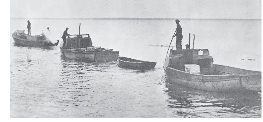
Pound net boat (far left) and trap net boats, Caseville, Michigan, 1920s.

Outcome – A measure of progress towards achievement of goals that are to be accomplished by 2020.