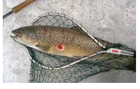
A brown trout with a sea lamprey wound

the effectiveness and efficiency of emerging technologies to allow for an overall program that better meets performance measures.