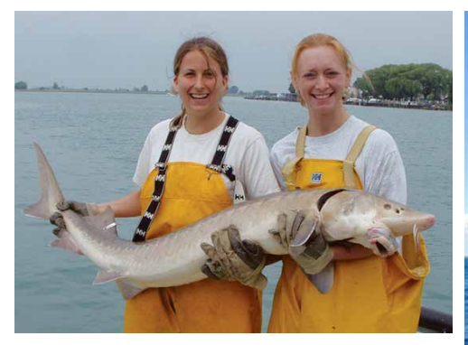
Fishery research is a collaborative endeavor and is essential to achieving and maintaining healthy Great Lakes ecosystems. Clockwise from top left, scientists work in the lab, dissecting a sea lamprey, walleye tagging, zooplankton sampling, and sturgeon assessment.