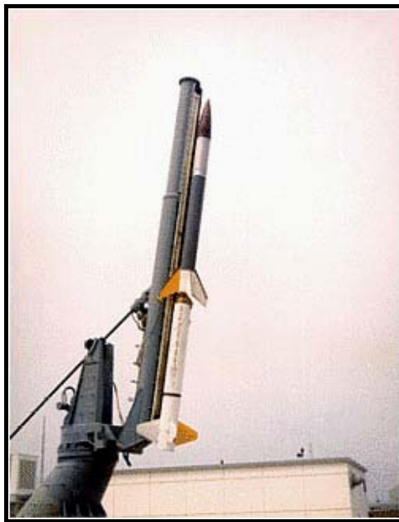
Figure F.2-1: Terrier-Malemute Vehicle

The Terrier-Malemute launch vehicle is a high performance two-stage vehicle used for payloads weighing less than 400 pounds. The first stage booster consists of a Terrier MK 12 Mod 1 rocket motor with four 340 square inch fin panels arranged in a cruciform configuration. The Terrier booster has an overall diameter of 18 inches. For a payload weight of 200 pounds, the longitudinal acceleration during the boost phase is 26g's. The second stage propulsion unit is a Thiokol Malemute TU-758 rocket motor which is designed especially for high altitude research rocket applications. The external diameter of the Malemute is 16 inches. Figure F.2-1 shows the Terrier-Malemute vehicle.