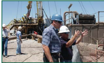
Nevada Site Specific Advisory Board members tour an Underground Test Area well drilling site in Area 16 of the Nevada National Security Site.

cost-effective corrective actions in the state. It also establishes a framework for identifying, prioritizing, investigating, remediating, and monitoring contaminated sites.