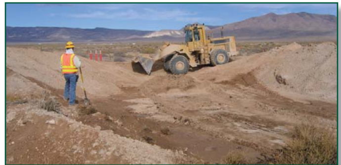
Contaminated soil in Area 6 of the Nevada National Security Site is remediated in accordance with the Federal Facility Agreement and Consent Order.

There are other public involvement activities associated with the DOE Environmental Management Program. Interested stakeholders can receive updates on proposed and current activities by signing up for the Environmental Management electronic mailing list at envmgt@nv.doe.gov . Nevada Site Specific Advisory Board meetings provide opportunities for the public to play an active role in the decision-making process, and speakers can be requested for presentations to community organizations.