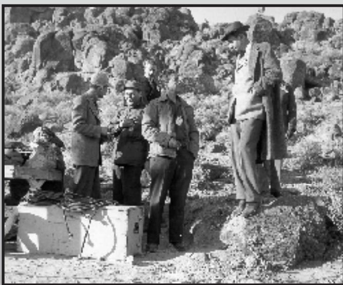
Journalists set up on News Nob to witness an atmospheric test in March 1953.

News Nob had a simple beginning. It received its name when a former Nevada Test Site construction worker who took a weather beaten board with a yellow door knob attached to it from an old outdoor lavatory and painted "This is News Nob" across the door in yellow. The original board is gone, but a replacement board still manages to hang onto to the side of the rock pile, despite years of wind and rain that tried to pry it loose from its precarious perch.