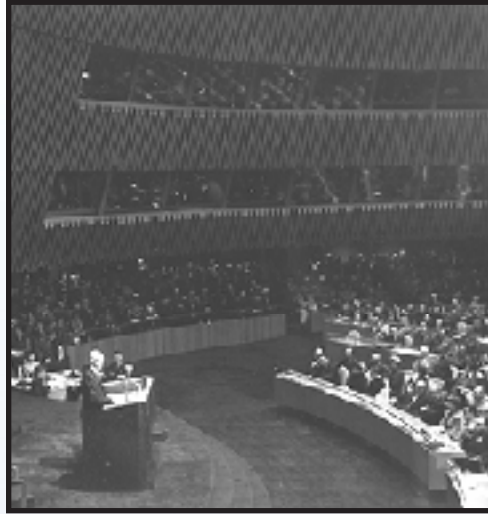
President Dwight D. Eisenhower makes his "Atoms for Peace" speech to the General Assembly of the United Nations on December 8, 1953.

On June 6, 1958, the United States Atomic Energy Commission, now the U.S. Department of Energy (DOE), announced the Plowshare Program, named for the biblical injunction to ensure peace by "beating swords into plowshares."