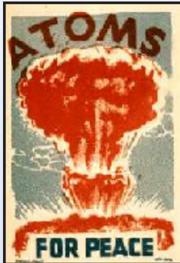
The Plowshare Program embodied President Eisenhower's Atoms for Peace initiative, evised in 1953.

When the moratorium ended on September 1, 1961, the United States resumed testing on September 15. The Gnome study, in December 1961, was the first Plowshare test. Project Gnome was intended to provide a detailed understanding of the underground environment created when a nuclear explosion was detonated in thick salt deposits located in New Mexico. Gnome also studied the feasibility of extracting trapped heat generated by a nuclear detonation for conversion into steam to produce electric power.