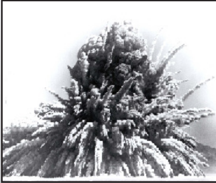
Sedan displaces approximately 12 million tons of earth during the 1962 detonation.

Sedan Crater was formed on July 6, 1962, when the U.S. Atomic Energy Commission, predecessor of the U.S. Department of Energy, conducted an excavation experiment using a