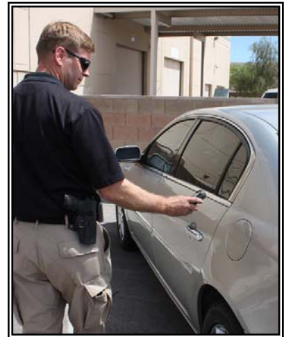
After an initial survey around the vehicle, an officer pinpoints the location of the hidden radioactive material.