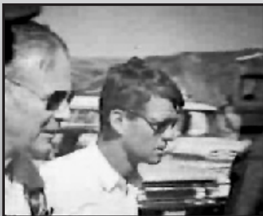
Chairman of the Joint Chiefs of Staff General Maxwell Taylor (left), and the U.S. Attorney General Robert F. Kennedy (center) were on hand to witness the historic event.