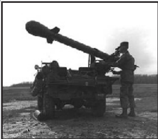
The Davy Crockett weapons system is mounted on a vehicle and prepared for launch.