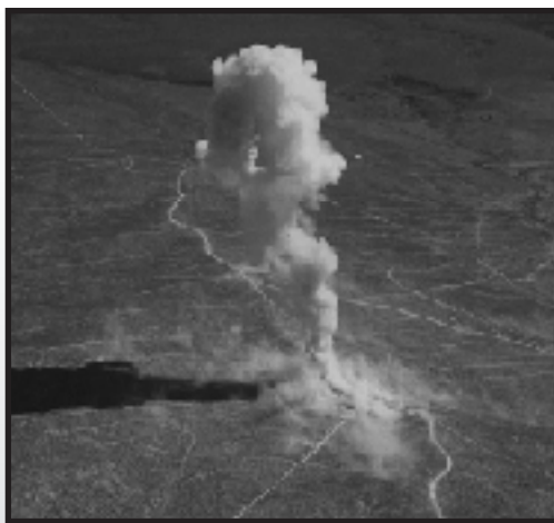
The top of the cloud formed by Little Feller I reached 11,000 feet and moved north-northwest from the point of detonation.

Meanwhile, one L-20 aircraft flew an aerial survey mission to ensure that no unauthorized personnel were approaching the target area. By 8:47 a.m., all scientific personnel had left the shot area. Thirty minutes before the detonation, the Atomic Energy Commission started its countdown for Little Feller I. From 9:45 to 9:55 a.m., all personnel forward of the bleacher site entered previously prepared trenches, where they remained until after the detonation.