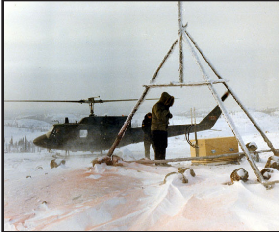
A microwave ranging transponder unit is placed under a landmark. The distance limitations of the units meant constant movement was necessary as the search moved along the footprint.