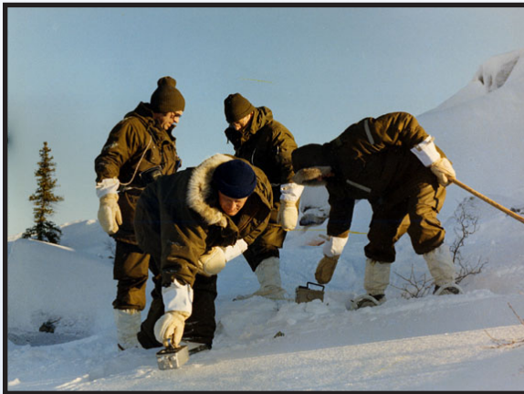
Team members, dressed in specially designed arctic clothing, begin the painstaking process of searching the area with hand-held radiation detectors.