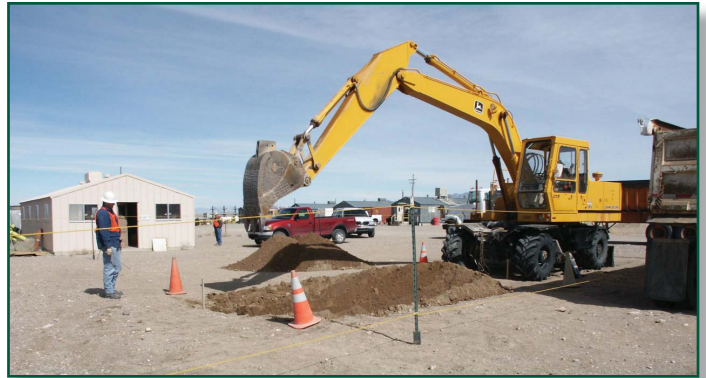
Soil excavation at a Contaminated Waste Site on the Tonopah Test Range.