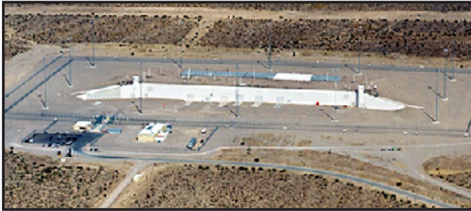
In addition to its physical isolation, two gun turrets at either end of the facility provide extended security at the DAF.

Construction began on the Device Assembly Facility (DAF) in the mid-1980s to support underground nuclear testing. DAF was designed and built to consolidate all nuclear explosive assembly functions, to provide safe structures for high explosive and nuclear explosive assembly operations, and to provide a state-of-the-art safeguards and security environment. Now that the United States is under a continuing nuclear testing moratorium, the DAF now supports