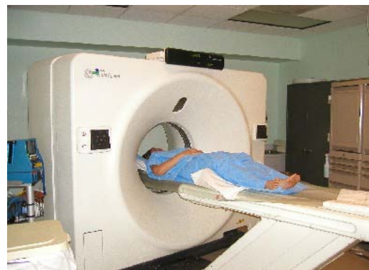
Medical Application - a CT Scan in Progress

We use man-made sources and applications of ionizing radiation such as power plants, smoke-detectors, x rays, C-T scans, and nuclear medicine procedures to improve our quality of life. Some people receive occupational exposures as a result of their work; jet crews, nuclear plant personnel, and medical staff are examples.