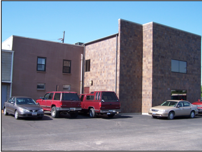
New building addition at the Fairfield, Ohio, Site, May 2006

above site-specific criteria was removed from the site and managed as a mixed waste stream in accordance with applicable hazardous waste regulations. Asbestos-containing floor tiles contaminated with radioactive materials were also removed, packaged, and shipped to a commercial low-level radioactive waste disposal facility.