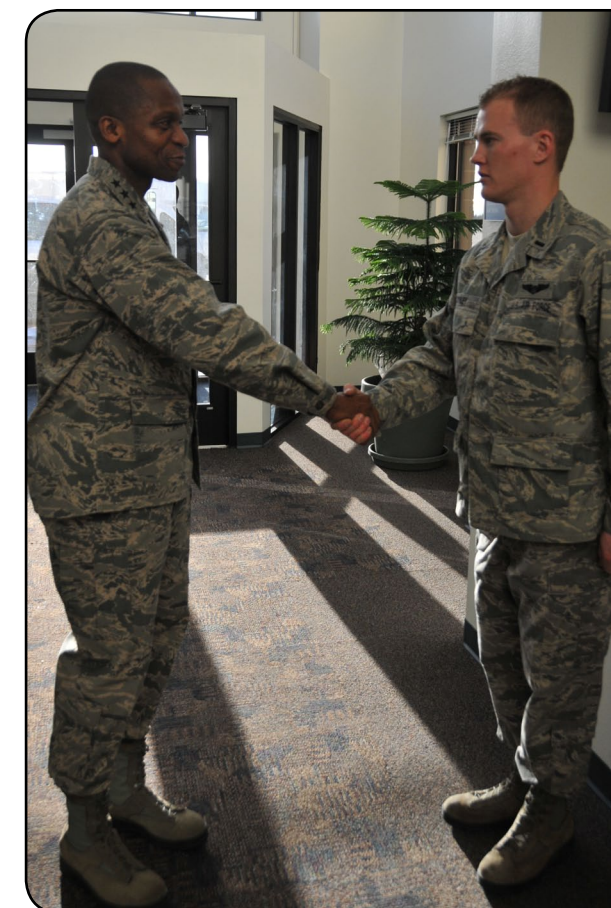
Lt. Gen. Darren W. McDew, 18th Air Force commander, visits with Airmen of the 153rd Airlift Wing, Dec. 18, 2012. The general also held an all call for Airmen where he addressed members of the wing and answered questions.