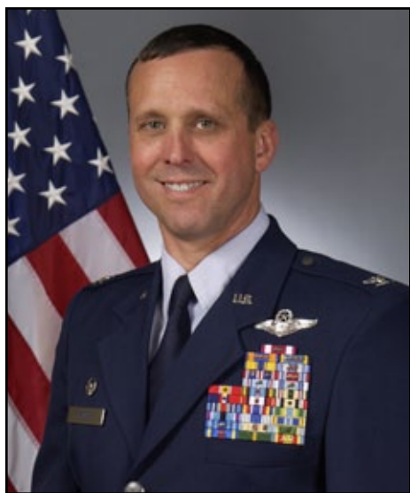
Col. Stephen E. Rader 153rd Airlift Wing commander

W elcome to March Drill. It's been fairly cold the last few weeks, with the eastern slope finally seeing some much needed snow. With that snow comes the inevitable slippery conditions in our parking lot and around our buildings. Please use extra caution when walking through areas that are not completely cleared of snow and ice. If conditions are poor in high traffic areas around your building, advise your building manager so that they can take care of the situation.