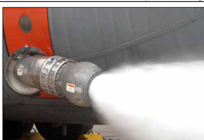
PETERSON AIR FORCE BASE, Colo. – When fired, the MAFFS II system releases 3,000 gallons (27,000 pounds) of water or retardant in five seconds with a force equal to that of one of the C-130's four engines.