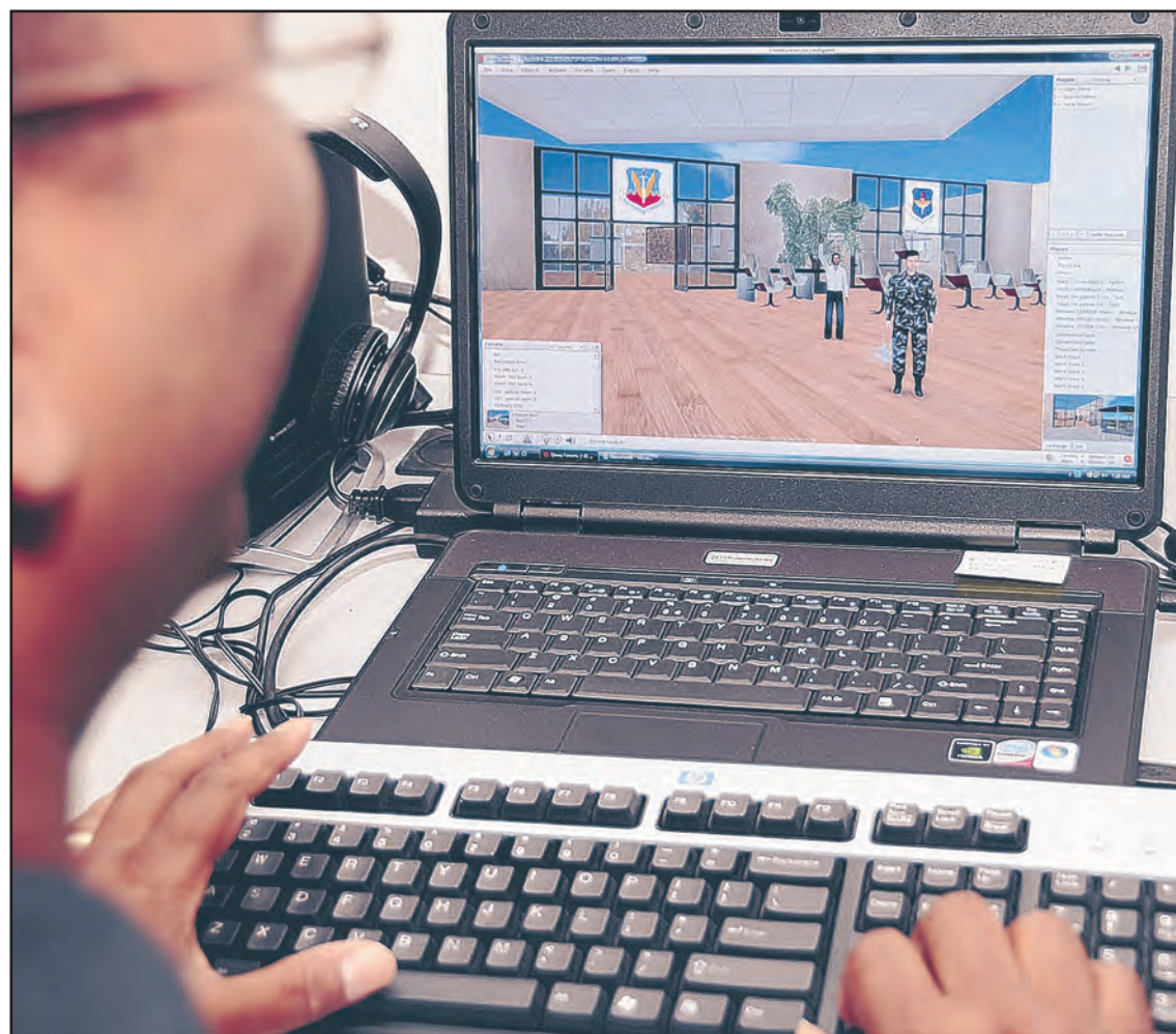
Doug Lee, right, 81st Training Support Squadron, edits functions to develop the different virtual training environments called forums for the MyBase prototype. The software allows changes to reflect user preferences.

The Air Force's new interactive, avatar-centric, computer-