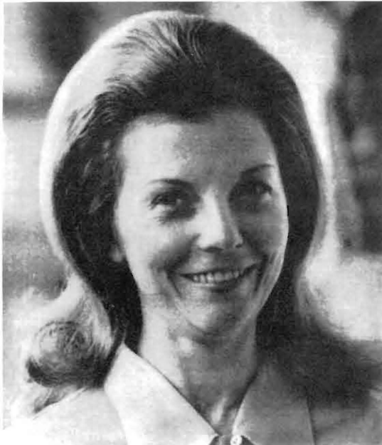
Vice President Isabel Martínez de Perón

22. Perón's precarious health focuses attention on the succession problem. He has a history of recent heart attacks, coronary insufficiency, an apparently low-grade malignancy of the prostate, and other medical disorders. The following paragraphs outline three broad courses of development in the event of his death or incapacitation: a by-the-book succession of the vice president; a non-constitutional transfer of power to an interim govern-