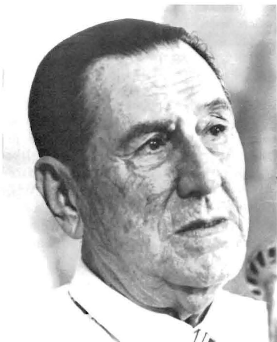
President Juan Domingo Perón

1. Now that he has returned to power, Juan Perón's first tasks are to restore domestic prosperity and to heal bitter political and social divisions. This will be no easy task for an ailing man who is nearly 80. Straddling