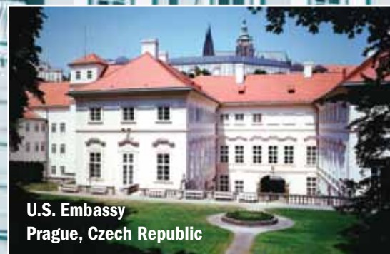
U.S. Embassy Prague, Czech Republic