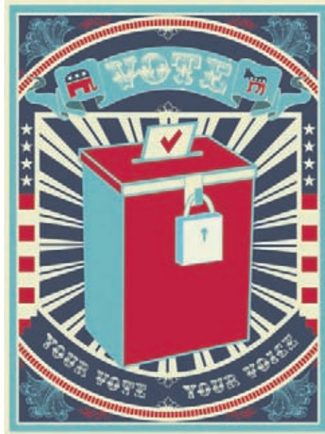
U.S. Air Force graphic

Our forefathers became experts in governmental design before drafting our Constitution. Their research took them to antiquity where Polybius, a Roman, argued that a mixed government was most beneficial to society. Polybius characterized three parts to a mixed government: democracy (the people), aristocracy (the nobility), and monarchy (the king).