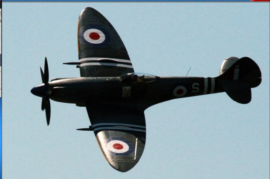
Photos clockwise, starting top: The Army Golden Knights touch down, Canada's Skyhawks Parachute Team perform numerous thrilling stunts, a Spitfire Mk4 does a flyby and below a MiG-17, part of the Heavy Metal Jet Team, catches up with a pair of Aero Vodochovy L-39s.