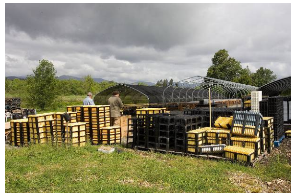
Preparing seed trays at The Nature Conservancy's Shotwell's Landing Nursery.

Forty large seed production boxes (32'x 4') were installed, filled with growing medium, and sown with seeds collected during the 2005 and 2006 collection seasons. An additional 12 smaller boxes were built or retrofitted, filled, and sown with target species. Three different types of irrigation systems were installed in the boxes. The entire system is controlled automatically on five different zones that can be programmed according to changing irrigation needs throughout the year. The system of mainlines and lateral lines was designed for flexibility over the course of the project: as seed crops germinate, grow, mature, and produce seed, their irrigation requirements will change.