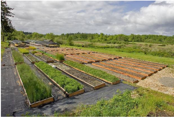
TNC's Shotwell's Landing Nursery.

The infrastructure goal for plug production was to build a plug propagation area that is easily serviceable and that provides all the components necessary for the production of high quality plugs deliverable on a precise schedule. The plugs grown for this project are to be transplanted into seed production areas outside of the nursery. Plugs produced for this project need to be grown in an ambient temperature nursery, also known as an "outdoor" nursery. The existing plug production area at the nursery was improved and expanded to provide the growing capacity necessary for the production demand under this project. Engineered non-code metal cold frame buildings were purchased and transported. Three 96' x 20' buildings