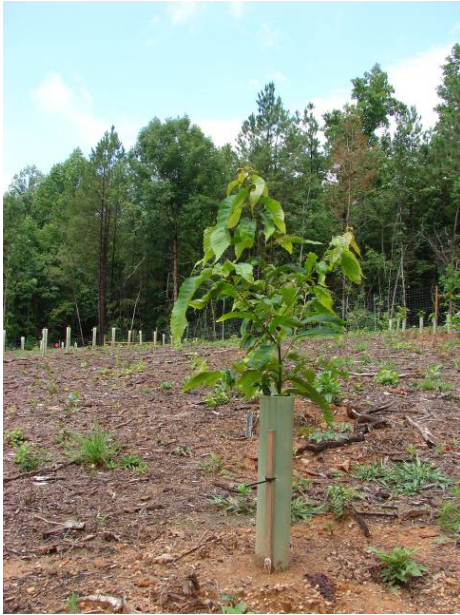
A two-year old hybrid chestnut seedling planted in April 2009 at the American chestnut backcross orchard at VTS-Catoosa.

100% American chestnut trees. Within each generation, only trees exhibiting both blight resistance and traits that are more outwardly American chestnut are used to produce seed for the following generation. The term “backcross” is used to indicate that a 50/50 hybrid (an offspring with parents of two different species, in this case, American chestnut and Chinese chestnut) is crossed back to a plant of the same pedigree as one of its parents. Backcrossing is used with American chestnuts to get trees that hold onto only one small portion of the genetic code from their Chinese ancestors — blight resistance, but that still look like American chestnut trees.