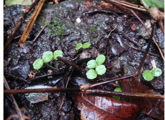
Cyanea superba seedlings discovered growing in the wild beneath plants that had been re-introduced into Kahanahaiki by NRP staff.

Fences were built to keep pigs and goats from damaging the Cyanea 's fragile roots and seedlings. Invasive weeds were kept in check. Slug deterrents were put in place to keep these non-native plant predators from nibbling up precious Cyanea seedlings. Rat-traps and rat bait stations were put in place to keep rodents from decimating the Cyanea fruit. And if the NRP staff could get to the plants before the rats, they would collect fruit and bring the seeds back to the seed lab.