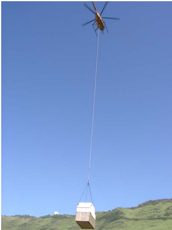
Helicopter delivers a plant box filled with endangered plants to a remote native forest where NRP staff re-introduce them to the wild.

The precious seeds were placed in petri dishes and grown in incubators. From there, seedlings were moved into the nurseries where they were nurtured and monitored until they reached a full meter in height, a process that normally takes up to three years. Unfortunately, during these ten years of intensive management, the last remaining Cyanea superba went extinct in the wild. But NRP anticipated this sad day and the Cyanea seedlings that were growing in NRP nurseries would soon fill the void in the native forest of Makua. To date, over 250 Cyanea superba plants have been grown and returned to Makua by NRP staff and this week's delivery would raise the number by an additional 29 plants.