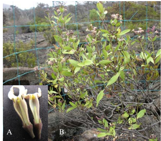
A) Kadua coriacea flowers showing heterostyly. B) Adult plant of Kadua coriacea .

A summary on the findings of the study suggests that in 2009, K. coriacea 's flowering peak in PTA occurred from April to July, following the rainy season. However, some plants were found to be flowering earlier and/or later than the peak dates. The majority of the plants in the population are adult, indicating that most plants are capable of reproducing. The flowers of K. coriacea are heterostyly (having different flower morphologies, usually to promote cross pollination) and occasionally varying in flower size and color. All of the five manipulated pollination experiments resulted in a fruit set at different proportions. Therefore, the preliminary results suggest that plants may self-pollinate. Self-pollination may lead to inbreeding and possibly inbreeding depression, although the genetic fitness of the seeds and seedlings are yet to be investigated.