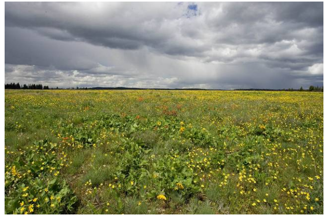
Puget balsamroot, Indian paintbrush and western buttercup bloom in high quality prairie in the artillery impact area. This prairie is home to all four federal candidates that occur on Fort Lewis and contains the highest quality prairie remaining because of the annual artillery-initiated fires.

Interspersed in these prairies were numerous kettle wetlands. These were formed when large chunks of ice that were carried in the glacial floods and became buried by subsequent debris flows. As the ice slowly melted, they left behind a series of depressions that ranged in size from less than an acre to over a hundred acres.