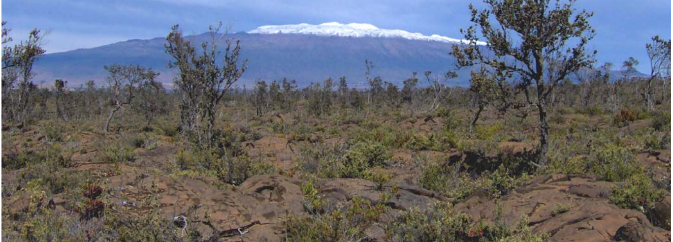
Subalpine dry forest with Mauna Kea in the background.