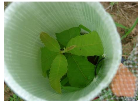
Protective tree tubes are placed on top of seeds and seedlings as they are planted to protect the trees from small mammal herbivores.

All of this changed after the arrival of the Asian chestnut blight ( Cryphonectria parasitica ) in the United States in the late 1890s. The first documented occurrence of the blight in the United States was in 1904 at the New York Zoological Garden. Its microscopic spores are released into the air and infect chestnut tissue when they land on wounds or trunk fissures, which are created when a tree matures. This fungus decimated American chestnut stands and, by 1950, most of the chestnut trees throughout its native range, east of the Mississippi, were dead or dying. In just a few decades, the American chestnut went from being the keystone species on an estimated 9 million acres to a relic, hanging on in the sprouts arising from the root stock of the fallen trees and a few surviving mature trees scattered across the species' range. The sprouts, too, are almost always killed by the blight before they reach reproductive age, so natural reproduction is almost unknown.