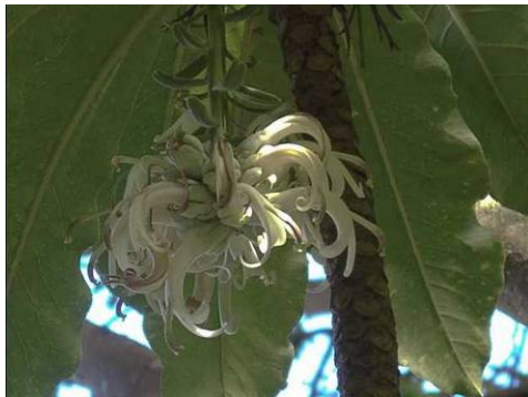
Cyanea flower. The Cyanea superba is one of 73 federally-listed endangered species that the Army manages on Oahu.

NRP staff is hopeful that this week’s re-introduction of Cyanea superba will be a significant boost to the seed making potential. “And if we can protect the forest around them,” says Keir, “then hopefully we can just step back and let it happen.”