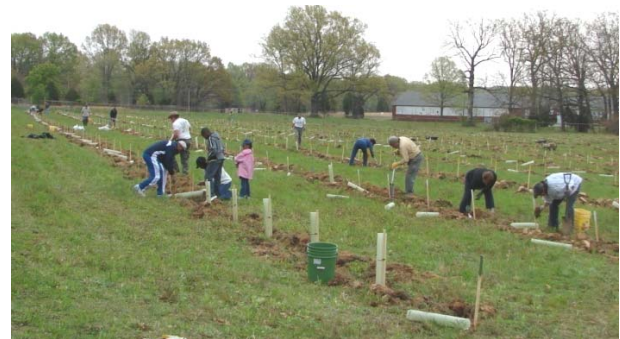
On April 18, 2009, 20 volunteers participated in the American chestnut orchard planting at VTS-Milan in Carroll County, Tennessee.

land for military training; they will be maintained and surveyed annually for the duration of this project. More trees will likely be added to the orchards wherever a seed fails to germinate and/or wherever gaps are created by dead or culled trees. In addition, the orchard at VTS-Milan has well over an acre of fenced land on which seeds may be planted. There are some pedigrees that perform better than others at each of the orchards and once the first year's data has been thoroughly analyzed, the backcross varieties that are more suited to growing conditions at the orchards will be used in follow-up plantings in the coming years.