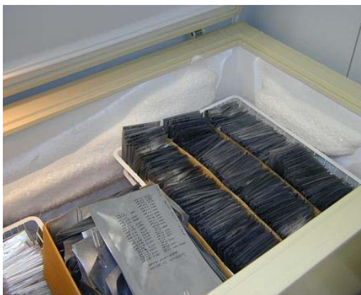
Seed freezer storage at Berry Botanic Garden.

The final assessment of 185 species on DoD lands showed that 61 DoD species of concern -- almost one-third of the species surveyed -- have no material secured in storage. In addition, 69 species collections are not from DoD lands specifically, which may limit the department's ability to conduct restoration of these species with the most desirable material. CPC's report provided DoD with detailed information about all existing collections, enabling DoD personnel to prioritize planning for new and additional collections of plant material.