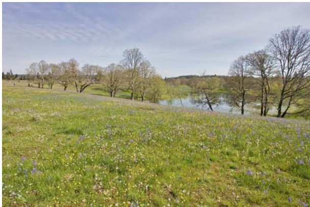
A kettle wetland surrounded by Garry oak in high quality prairie in the artillery impact area on Fort Lewis. This is one of only a few wetlands that still resemble what they historically looked like and all are located in the Artillery Impact Area (AIA). The AIA prairie is maintained by artillery-initiated fires since the Fort was established in 1917. All other prairie wetlands have now been encroached by conifers around their margins.

These ephemeral kettle wetlands fill with winter precipitation and slowly recede through the summer months until they are completely dry. They provide important water resources for wildlife, but also provide a suite of different flora. One of these, water howellia ( Howellia aquatilis ), is federally-listed as threatened and can only be found in two areas on earth: SPS prairies and similar ephemeral wetlands along the glacial margin near Spokane, WA. This annual, aquatic species requires wetlands that dry each year so that seeds can germinate on the exposed soil. Twenty-two of the 28 known wetlands in western Washington occur on Fort Lewis.