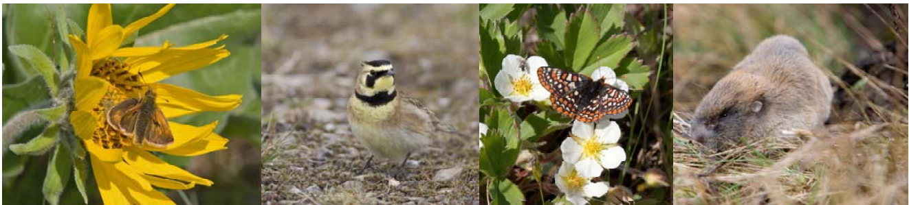
The federal candidate species that will benefit from the prairie restoration: (Left to Right: Mardon Skipper, Streaked Horned Lark, Taylor's Checkerspot, and Mazama Pocket Gopher).

The open prairie landscape on Fort Lewis is used extensively for most military training, including artillery practice, large arms fire, Stryker vehicle training, firebase construction, parachute drop zones and foot training. Habitat restoration and enhancement efforts allow military trainers greater flexibility to use existing DoD lands and support Fort Lewis' commitment to recover federal candidate species.