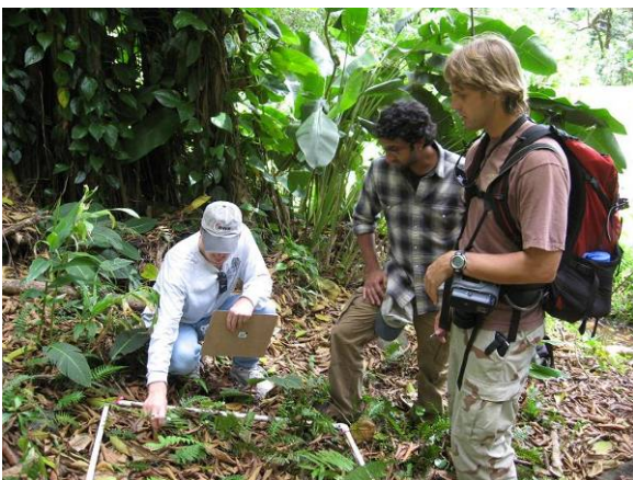
Workshop participants complete an exercise in monitoring.

The six-day workshops focused on 17 different topics, including rare and imperiled plants, plant protection and legislation, how to measure success, and how to inventory and monitor imperiled plants. Nearly 40 experienced botanists from academia, agencies and non-governmental organizations helped to develop the workshop. These botanists also worked collaboratively to put together take-home resource materials for attendees.