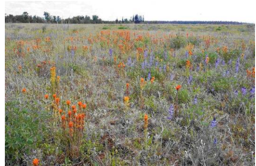
High quality prairie on Fort Lewis.

Approximately two-thirds of the remaining prairie habitat now occurs on Fort Lewis, while a handful of smaller parcels are located on state and county property. Many prairie species are now very rare: two are federally-listed as threatened, four are federal candidate species, and there are five federal species of concern. In addition, several more species are listed as endangered, threatened or sensitive by the State of Washington. Many more that have no ranking because they occur elsewhere in their range are so rare locally, that they are only known from just a handful of plants. Over three dozen species are known to already be extirpated from the prairies and many more are on the verge of being extirpated.