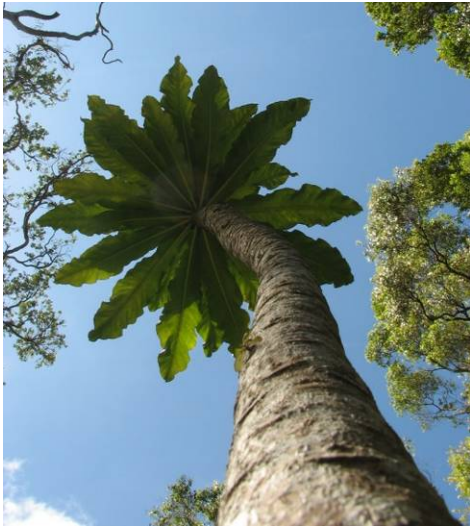
Cyanea superba looking skyward.