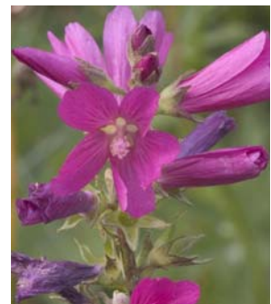
Rose Checker Mallow