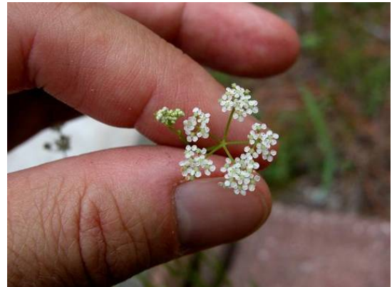
Harperella, known from only ten populations, is in the same plant family as carrots and dill, as well as several other plants that have medicinal value.

Some of the imperiled plants DoD is concerned about, such as Harperella ( Ptilimnium nodosum ), are already part of CPC's National Collection of Endangered Plants, wherein CPC institutions are assigned to secure genetic samples ex-situ in case a species becomes extinct or no longer reproduces in the wild.