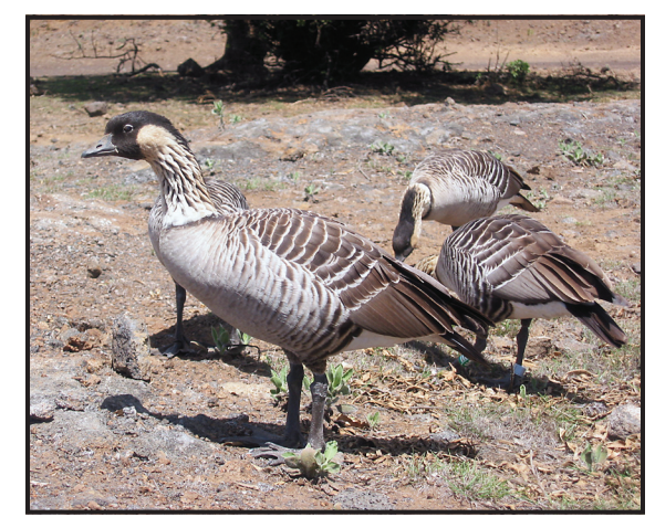
Nēnē resting at Range 1.

DO NOT move, chase or "encourage" birds off the range. Harassment of n\bar{e}n\bar{e} can lead to a $50,000 personal fine.