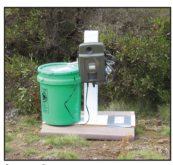
Camera at Range 1.

Help Us Keep You Training Report All Nēnē