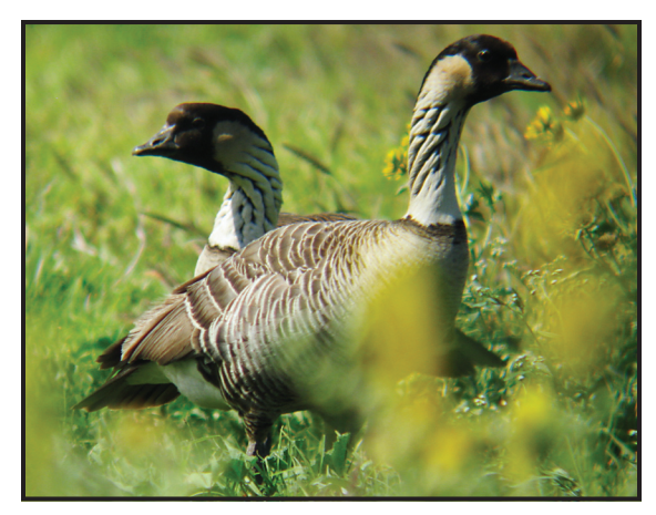
Nēnē pair in Keamuku.