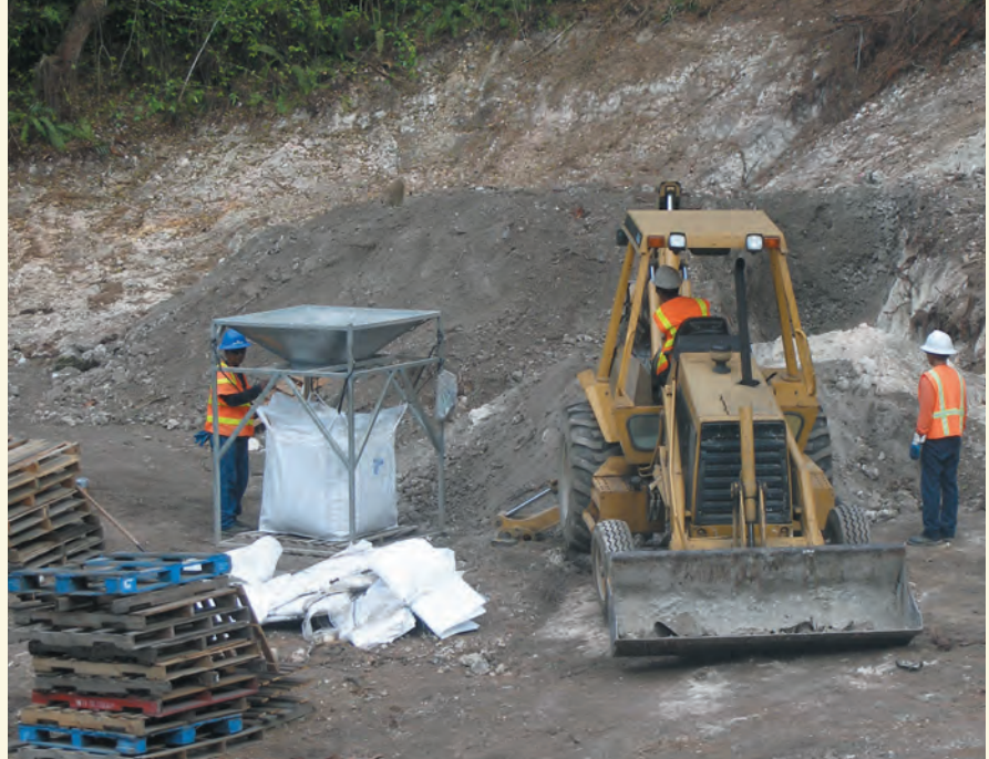
Contaminated soil is removed from the Edoni Formerly Used Defense Site (FUDS) on Saipan. The extraction site was used by the U.S. military during and after World War II as a waste repository.

"We are very pleased to be winding up another successful environmental project that will have a positive impact on the people of Saipan. We are fully committed to public health and the safety of our workers and the public," Takemoto said.