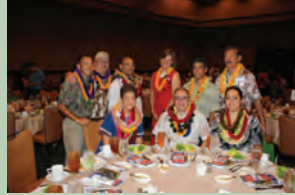
Team Excellence: Assessment Team of the Federated States of Micronesia's Program Management Unit