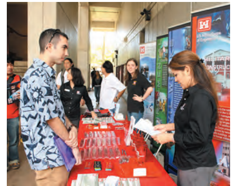
Engineers and Human Resource Representatives from Pacific Ocean Division and Honolulu District spoke to students at the University of Hawaii at Manoa College of Engineering Career Fair.

Center from many engineering organizations on display Feb. 19-24; and attendance at the Engineers Week Awards Banquet Feb. 25 at the Hale Koa Hotel, which attracted more than 300 members and friends of the 17 organizations within the Hawaii Council of Engineer-