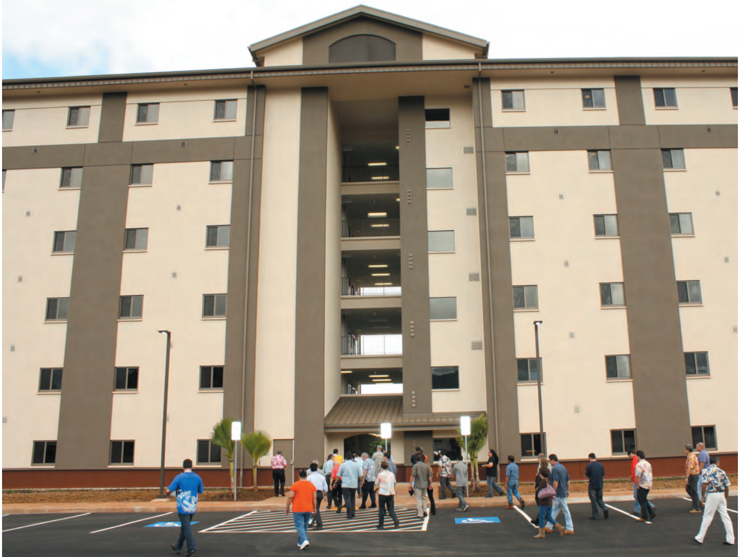
Schofield Soldiers and UEPH project engineers tour the new UEPH on Porter Loop. The project consisted of designing and constructing a six-story barracks to house 192 personnel in a standard one-plus-one room configuration.