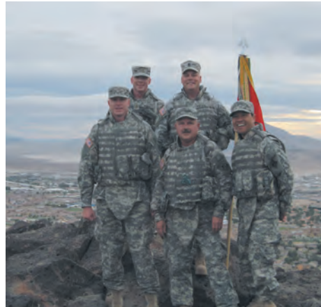
The Honolulu-District-based 565th Engineer Detachment Forward Engineer Support Team-Advance (FEST-A) pauses for a group photo at the National Training Center (NTC) at Fort Irwin, Calif.

"Our critical training needs for deployment were accomplished by integrating with a maneuver unit from the New York Army National