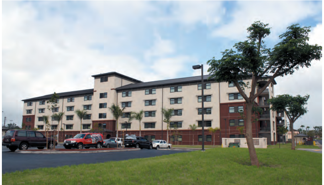
The New Barracks Complex on Lyman Road at Schofield Barracks is now home to nearly 400 2nd Brigade Soldiers. (Below) Each of the 200, two-man suites features an energy-efficient shared kitchenette.

The FY08 New Barracks Complex contract was awarded to Absher Construction Company, Puyallup, Wash. in 2009 for $73,268,083.