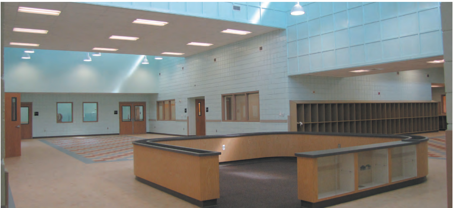
This photo shows the atrium area of the LEED Gold-certified School Age Center at Schofield Barracks. The $12.3-million center is named “Napua Koa,” or Children of the Warrior, and opened last year for children ages 6-10.