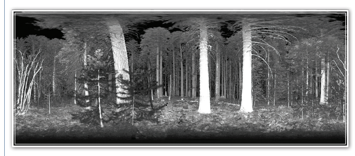
Example of ECHIDNA data for Bartlett Experimental Forest. (From ECHIDNA data set.)

ECHIDNA Lidar Campaigns: Forest Canopy Imagery and Field Data U.S.A., 2007-2009. This data set contains forest canopy scan data from the ECHIDNA Validation Instrument and field measurements data from three campaigns conducted in the United States: 2007 New England Campaign; 2008 Sierra National Forest Campaign; and 2009 New England Campaign. The New England field sites were located in Harvard Forest (Massachusetts), Howland Research Forest (Maine), and the Bartlett Experimental Forest (New Hampshire). The objective of the research was to evaluate the ability of the ECHIDNA ground-based, scanning near-infrared lidar to retrieve stem diameter, stem count density, stand height, leaf area index, foliage profile, foliage area volume density, and other useful forest structural parameters rapidly and accurately.