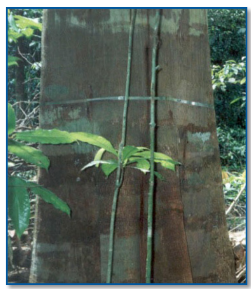
Dendrometer bands on trees at the km 83 site.

The 18 ha study plot at the km 83 site. Trees equipped with dendrometer bands before logging in November 2000 are shown as solid points. Gaps created by selective logging in September 2001 are shown as irregular shapes. The plot has 25 N-S transects (numbered 0 to 24) and 13 E-W transects (lettered A to M). The 65 m flux tower is indicated in block G4 (Figueira, et al., 2008).