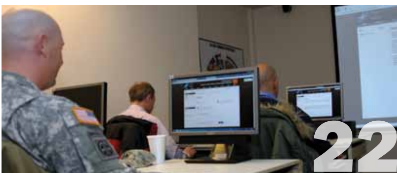
NCO CONFERENCE HOSTED BY KSF