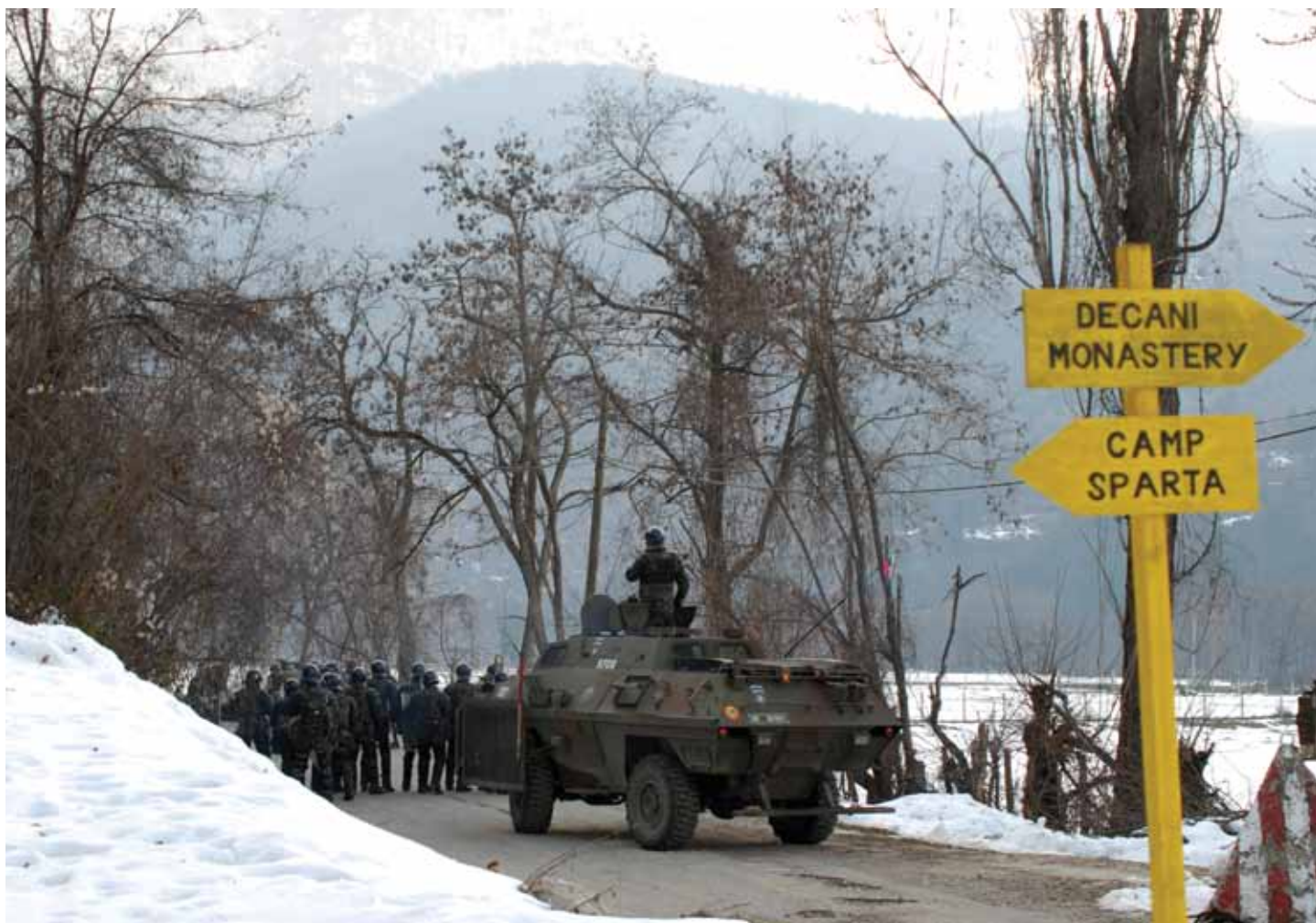
STORY: R. COSTA

The scenario tasked BLUEFOR, which was composed of a coy from KTM, under tactical control (TACON) to MNBG W and two platoons from MNBGW, to contain and disperse the protesters by