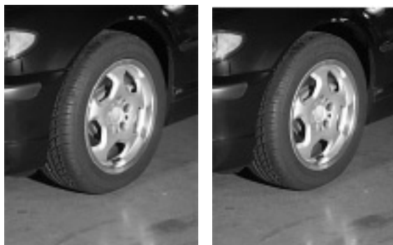
Above: Can you tell which tire is 30 percent under-inflated? Here's what they would look like in the morning, parked in your garage. Tough to tell, isn't it? Tire pressure must be checked with a quality gauge because the pressure cannot be accurately estimated through visual inspection. The tire on the left is under-inflated.

To obtain the greatest tire life, keep tires properly inflated at all times. The "right amount" of inflation for your tires is specified by the vehicle manufacturer and is shown on either the vehicle door edge, door post, glove box door or is listed in the vehicle owner's manual. Be