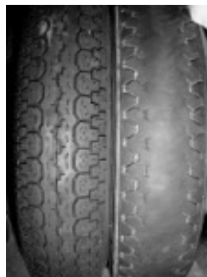
Some tires have wear bars, that is, rows of nubs that are recessed into the spaces between the treads. If any portion of a tire's tread is worn down to level with the wear bars, it is time to replace the tire. The tire at right is well past that point.

sure to check your tire pressure when the tire is "cold" (has not been driven on for three hours or more), which means that the tire is at the same temperature as the surrounding air. Therefore, when a tire is "cold," it is in thermal equilibrium and thus will give an accurate reading of tire pressure.