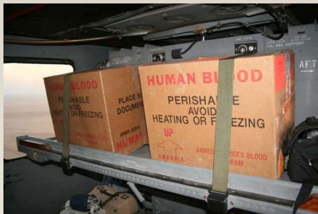
Large-scale blood receiving and shipping centers are located on Air Force bases with heavy volumes of available flights and aircraft to ensure the availability of transport going anywhere required.

Scientists around the world are working toward