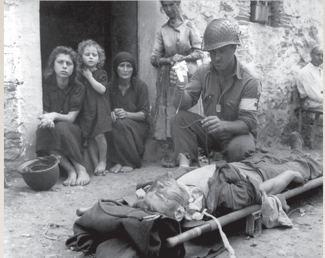
A World War I service member performs a blood transfusion in the field.

Through research and development, the U.S. Military has achieved significant break-throughs in medical science, such as the ability to collect blood in plastic containers; collect and store blood for extended lengths of time; maintain the appropriate temperature