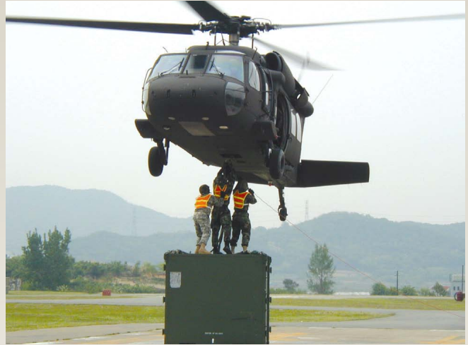
Large-scale blood receiving and shipping centers are located on Air Force bases with heavy volumes of available flights and aircraft to ensure the availability of transport going anywhere required.

Freeze-dried plasma is available in various parts of Europe. The Germans and French already have some sort of freeze-dried plasma, but it has not been approved for use in the U.S.,” Macdonald said. “Freeze-dried plasma is reconstituted with water prior to use.” There are some advantages to freeze-dried plasma. Freeze-drying plasma significantly decreases its weight (or “footprint” as the military calls it) creating advantages for storage and transportation not only at the hospital level, but also for medics in the battlefield. Freeze-drying allows plasma to be stored for significant periods of time at room temperature,