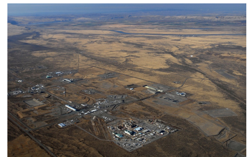
WTP Aerial View

Tank Closure & Waste Management Environmental Impact Statement