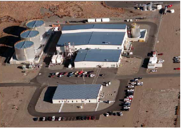
Effluent Treatment Facility