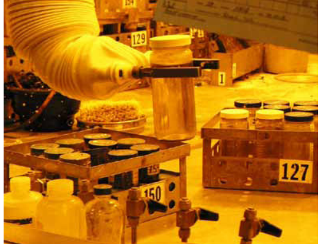
222-S Hot Cell