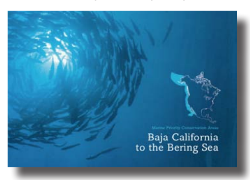
Marine Priority Conservation Areas: Baja California to the Bering Sea (2005)

The NAMPAN partnership has produced several technical products and conducted technical workshops and symposia, including: