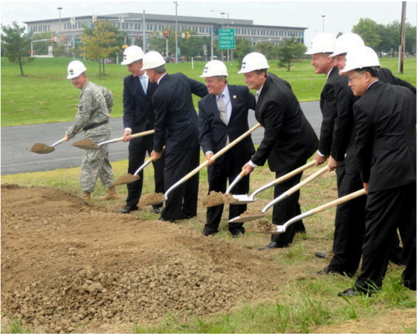
Officials break ground on the 43,000 square-foot post, Friday, August 17, 2012. Sen. Bob Casey, Reps. Tim Murphy, Mike Doyle, Jason Altmire and Mark Critz, and Allegheny County Executive Rich Fitzgerald each spoke at the ceremony.

Sen. Bob Casey, D-Scranton, said it was a testament to perseverance.