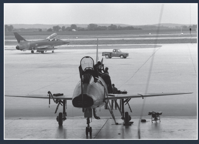
Maintaining a Sabre 1971 An F-100 Super Sabre is in the main hanger at the Sioux City Air National Guard base. The Main Hanger is still in use today after being modified in 2002 to accommodate the KC-135.

The Air Guard in Sioux City received its first F-100 in the summer of 1961. The Super Sabre became the airframe that was flown the longest in the wing's history when it was replaced by the A-7 Corsair 16 years later in 1977.