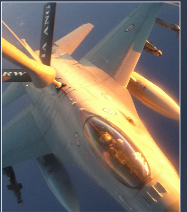
A Sioux City, Iowa KC-135 Stratotanker from the 185th Air Refueling Wing provides aerial refueling for a Royal Norwegian Air Force F-16 somewhere over the Mediterranean Sea. The mission is in support of Operation Unified Protector April 8, 2011. The 313th AEW supported Operation Unified Protector, a NATO-led mission in Libya to protect civilian and civilianpopulated areas under threat of attack.