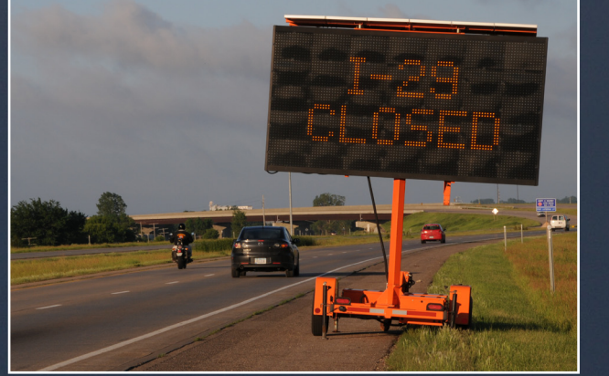
A sign along US Highway 75 in Sioux City, Iowa, notifies motorists that Interstate 29 was closed because of summer flooding. I-29 runs north and south along the Iowa-Nebraska border adjacent to the flooding Missouri River.