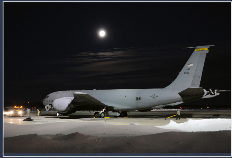
A full moon serves as a picturesque back drop on a bitterly cold January morning. With temperatures in the single digits, crew members from the 185th Air Refueling Wing (ARW) prepare a KC-135 for a day of flying. The aircraft is on the ramp at the Iowa National Guard's 185th Air Refueling Wing in Sioux City, Iowa.