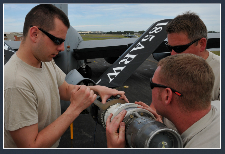
Airmen from the 185th Air Refueling Wing (ARW) work on the fuel boom of a KC-135 while at the Royal Australian Air Force base in Williamtown, New South Wales, Australia on February 25, 2011. The 185th ARW participated in a joint flight exercise, "Sentry Down Under", refueling F-16C and F-18 Fighter Jets while in Australia.

The 185th Air Refueling Wing provides rapid, global mobility and sustainment for America's Armed Forces. The 185th also plays a crucial role in providing humanitarian, state and national disaster response.